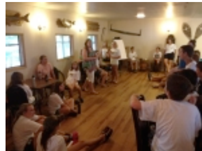
Workshop participants build the local capacity to support the positive development of children and youth.

Learn more about this training opportunity.