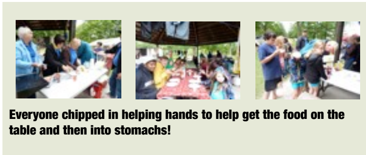
Everyone chipped in helping hands to help get the food on the table and then into stomachs!

paraphernalia needed to put on a stomach filling supper for hungry campers.